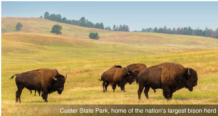
Custer State Park, home of the nation's largest bison herd

Holiday Inn Rushmore Plaza, Rapid City, South Dakota