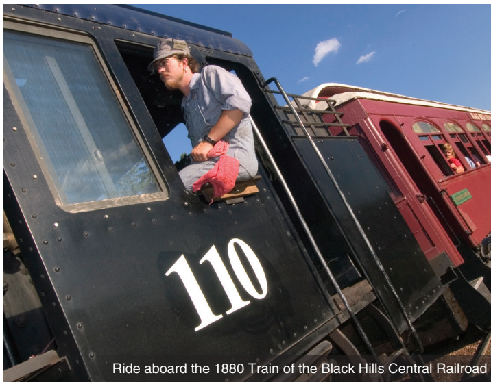
Ride aboard the 1880 Train of the Black Hills Central Railroad

DAY 5 Wall Drug Store and Badlands National Park: Begin the day at the Chapel in the Hills, a quiet retreat nestled at the foot of the Black Hills. Then stop at famed Wall Drug Store, a unique shopping emporium featuring western clothing, Indian pottery and favorite watering hole since the 1930s. Enjoy time for shopping and an on own lunch. Then, a local guide takes you through Badlands National Park, a uniquely beautiful geologic area formed over millions of years by wind, rain and erosion. Later, return to Rapid City for a farewell dinner featuring the entertainment of an Indian dancer, storyteller and flute player. Meals: B, D